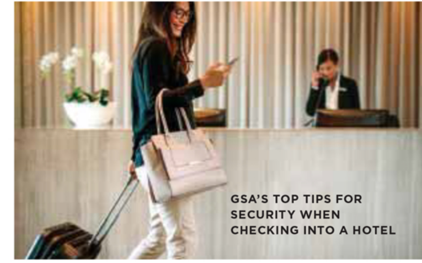
GSA'S TOP TIPS FOR SECURITY WHEN CHECKING INTO A HOTEL

WHEN YOU RECEIVE your room key at reception, ask them to show your room key number written down rather than saying it out loud. If someone overhears your booking name and room number, they may be able to find a way to access your room when you are not there.